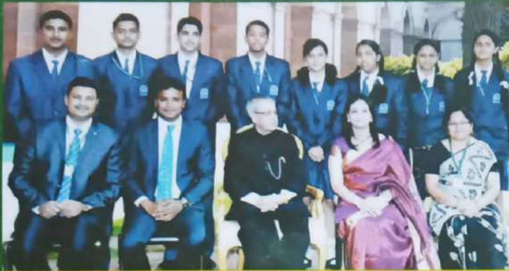
Meeting with President of India