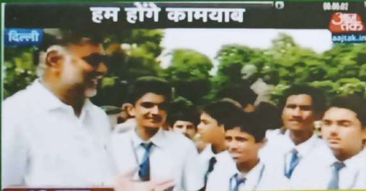
DPS students with Member of Parliament Shri Pahlad Patel