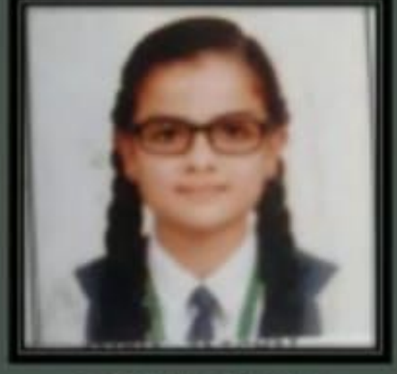
SAWNI JAISWAL DEPUTY PRIME MINISTER