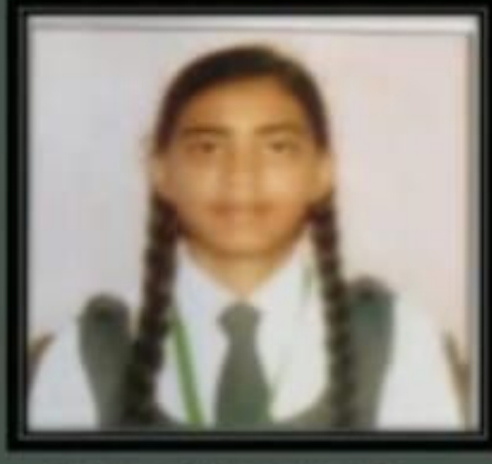
MS.SONIA DUBEY PRIME MINISTER